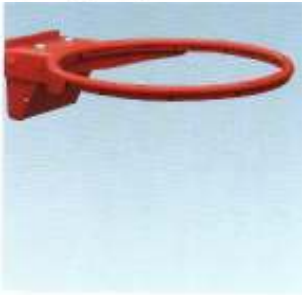
ZLQ-2 弹性篮圈 (1125) Spring Leaded Ring(ZLQ-2)