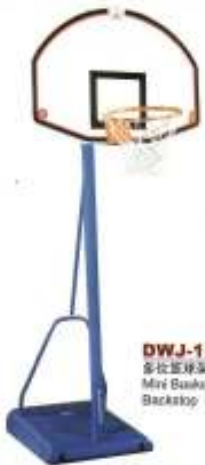
DWJ-1 多拉球架 (1158) Mini Basketball Backstop (DWJ-1)