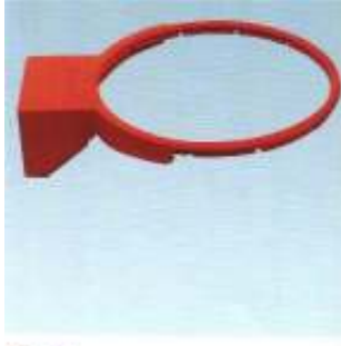
ZLQ-3 固定篮圈 (1126) Fixed Ring(ZLQ-3)