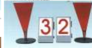
FGQ-1 篮球赛全队位置器 (1137) Team Post Indicator Controller