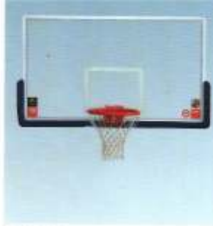
BGB-1B 高强度安全玻璃篮板 (1011) High Strength Security Glass Backboard(BGB-1B)