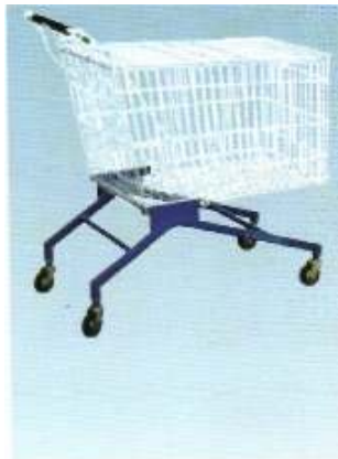
QTC-2 轻便式球类推车 (1144) Portable Ball Carrier (QTC-2)