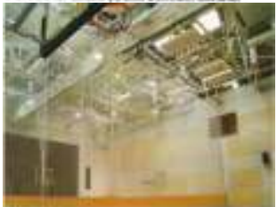
XZJ-1B 墙上固定液压球架 (1000) Wall Mounted Hydraulic Basketball Backstop