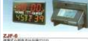
ZJF-6 便携式小型电子记分牌 (1115) Portable Mini Electronic Scoreboard