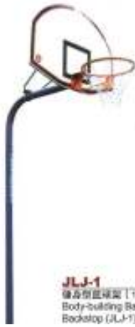
JLJ-1 健身型球架 (1119) Body-building Basketball Backstop (JLJ-1)