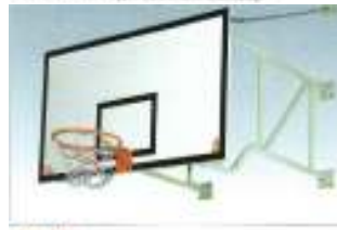
XZJ-2 墙上固定球架 (1117) Wall Mounted Folding Basketball Backstop