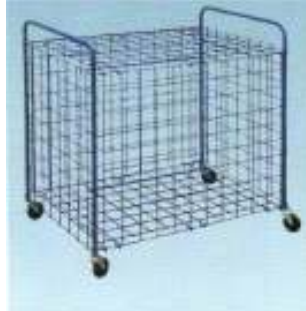
QTC-5 折叠式球类推车 (1169) Folding Ball Carrier(QTC-5)