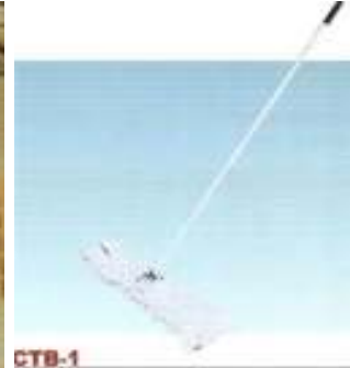
CTB-1 球场地图 (1147) Map For Gym