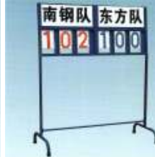
LFD-2 篮球赛记分牌 (1139) Scoreboard for Basketball Match