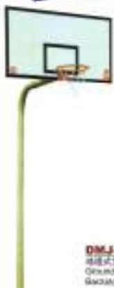
DMJ-1 圆形穿孔球架 (1120) Round Bored Basketball Backstop (DMJ-1)