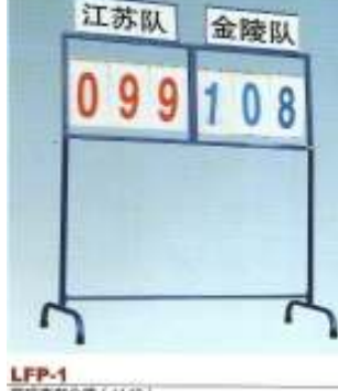
LFP-1 篮球赛记分牌 (1140) Turning Scoreboard For Basketball Match