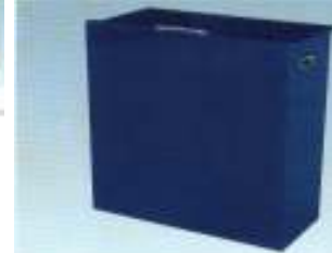
JFZ-1 乒乓球记分表 (1639) Score Table

NOTE: Our equipment are from international certification equipment manufacturer – FIBA, IAAF, CTTA, CSA amongst others..