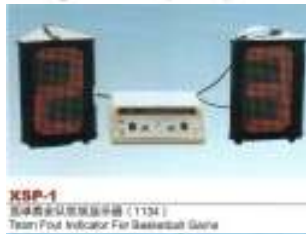
XSP-1 篮球赛全队位置指示器 (1134) Team Post Indicator For Basketball Game