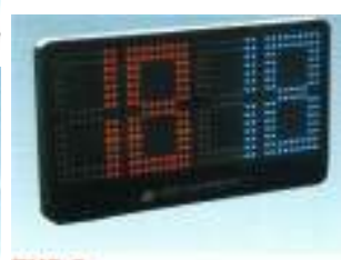
ZHP-2 足球电子换人牌 (1208) Electronic Subst Rule