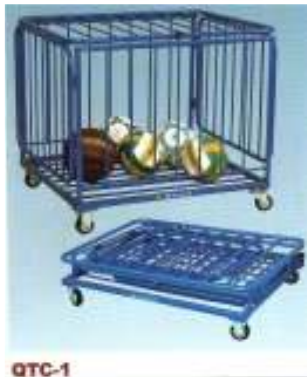
QTC-1 折叠式球类推车 (1143) Folding Ball Carrier (QTC-1)