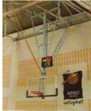
DXJ-1B 电动涂层球架 (1000) Electro Coating Basketball Backstop