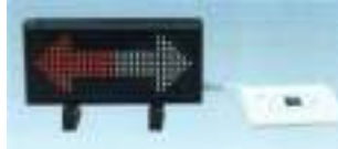
LFX-1 篮球赛球位指示器 (1166) Basketball Indicator of Field in Game