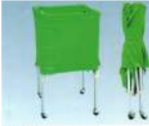
QTC-4 移动式球架 (1144) Portable Ball Center (QTC-4)