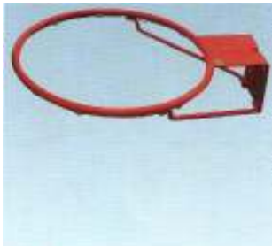
ZLQ-1 简易篮圈 (1124) Simple Ring(ZLQ-1)