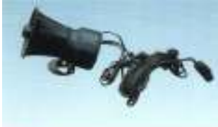
XXQ-1 篮球记分牌 (1138) Signal Machine For Basketball Competition Writer