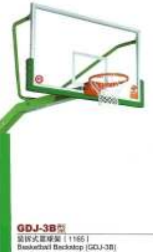
GDJ-3B 篮式篮板架 (1166) Basketball Backstop (GDJ-3B)

NOTE: Our equipment are from international certification equipment manufacturer – FIBA, IAAF, CTTA, CSA amongst others..