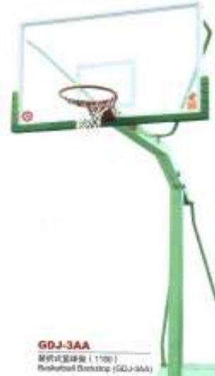
GDJ-3AA 篮式篮板架 (1100) Basketball Backstop (GDJ-3AA)