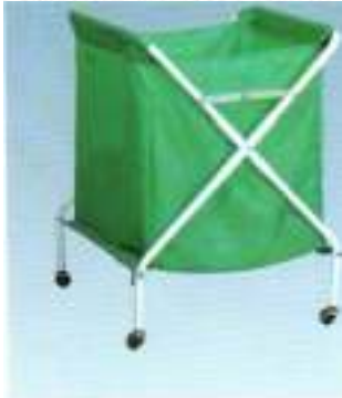
QTC-3 旅行式球架推车 (1145) Traveling Type Ball Center (QTC-3)