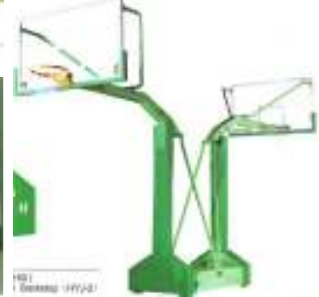
HJ 球架 (1174)