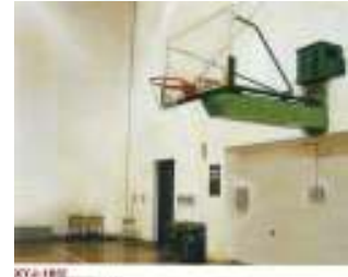
XZJ-1B 球架 (1117)

NOTE: Our equipment are from international certification equipment manufacturer – FIBA, IAAF, CTTA, CSA amongst others..