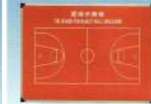
SJB-2 篮球战术图 (1155) Tactics Model For Basketball