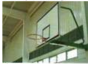
XQJ-1B 连续固定球架 (1141) Continuous Fixed Type Basketball Backstop